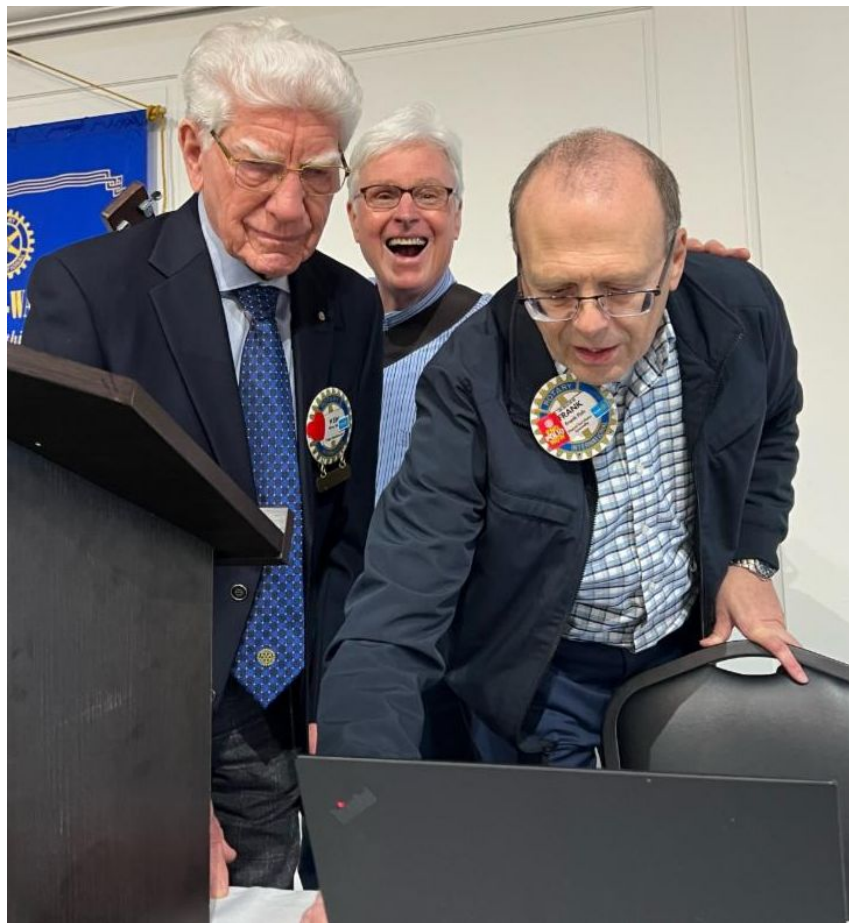
PHOTO OF THE WEEK - BEHIND THE SCENES! Who's Got the Caption? Send to: Office@PasadenaRotary.com